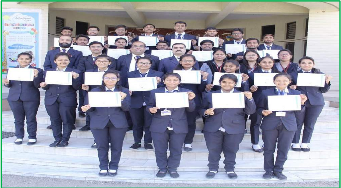
25 MCA Students get Certification on Microsoft Azure (AI Platform).